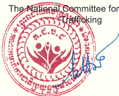
H.E. CHOU BUN ENG Permanent Vice-Chair

The National Committee for Counter Trafficking